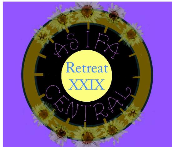
Retreat #29 - Collect the Set!